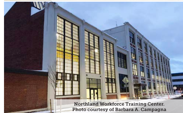
Northland Workforce Training Center.

Learn more about Northland Center at www.buffalourbandevelopment.com