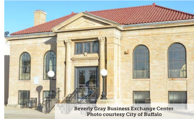
Beverly Gray Business Exchange Center.

Learn more about the Beverly Gray Business Exchange Center at www.buffalony.gov/847/Beverly-Gray-Business-Exchange-Center